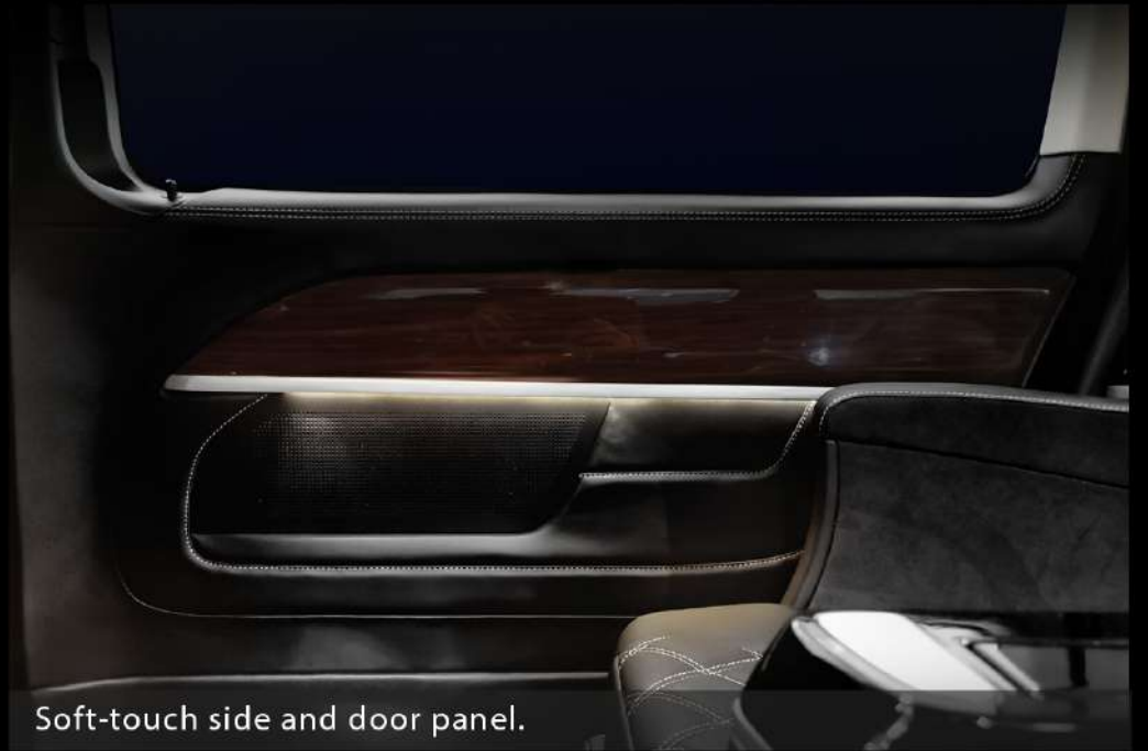
Soft-touch side and door panel.