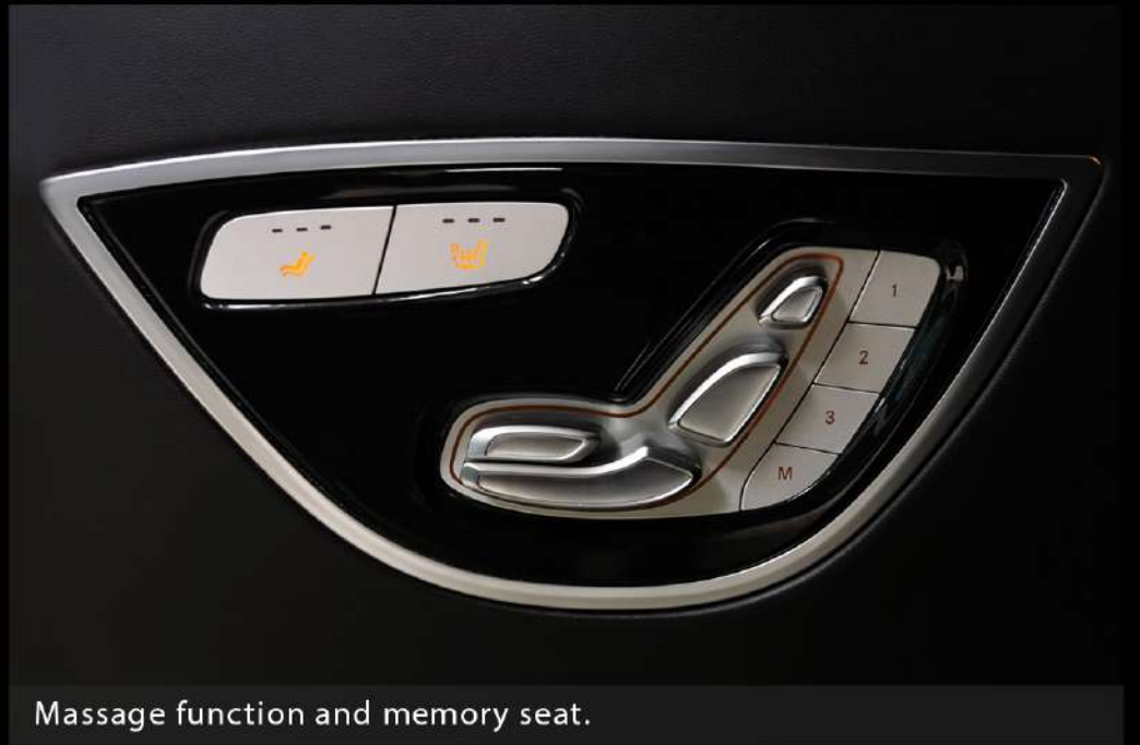
Massage function and memory seat.