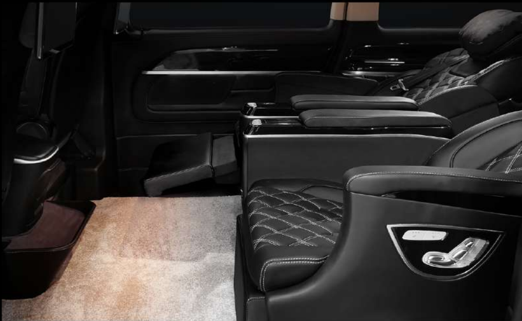
Motorized reclining system, Motorized shoulder, Motorized headrest.