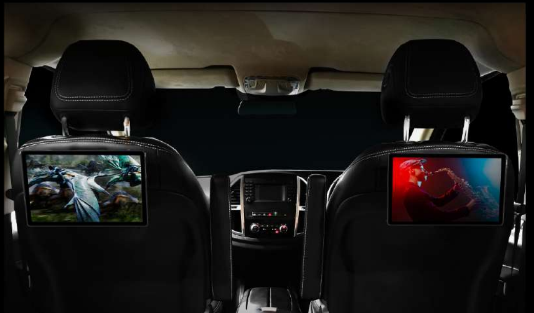
Two 10" Individual monitor, android multimedia, bluetooth & wifi.