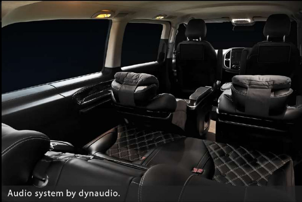
Audio system by dynaudio.