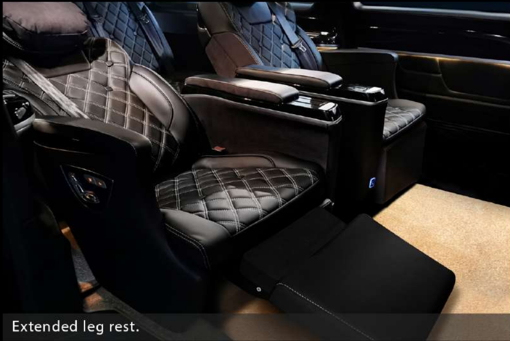
Extended leg rest.