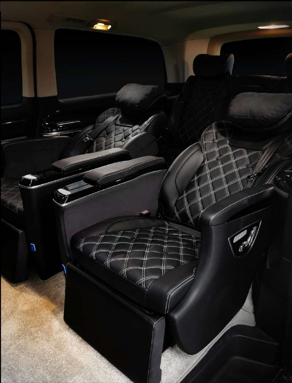
Captain seat with magnolia wollsdorf nappa exclusive.