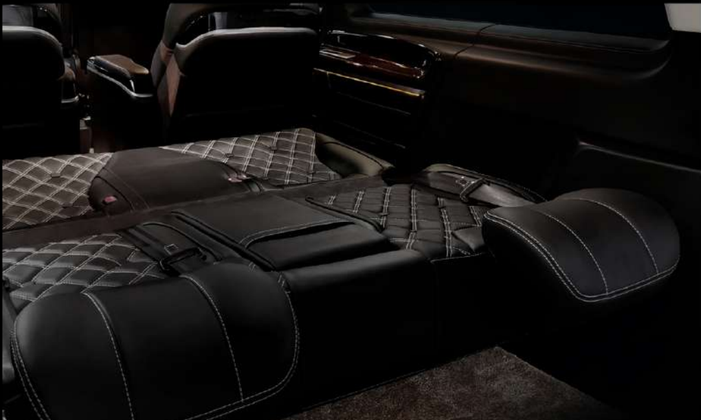
Rear seat flat bed fuction.