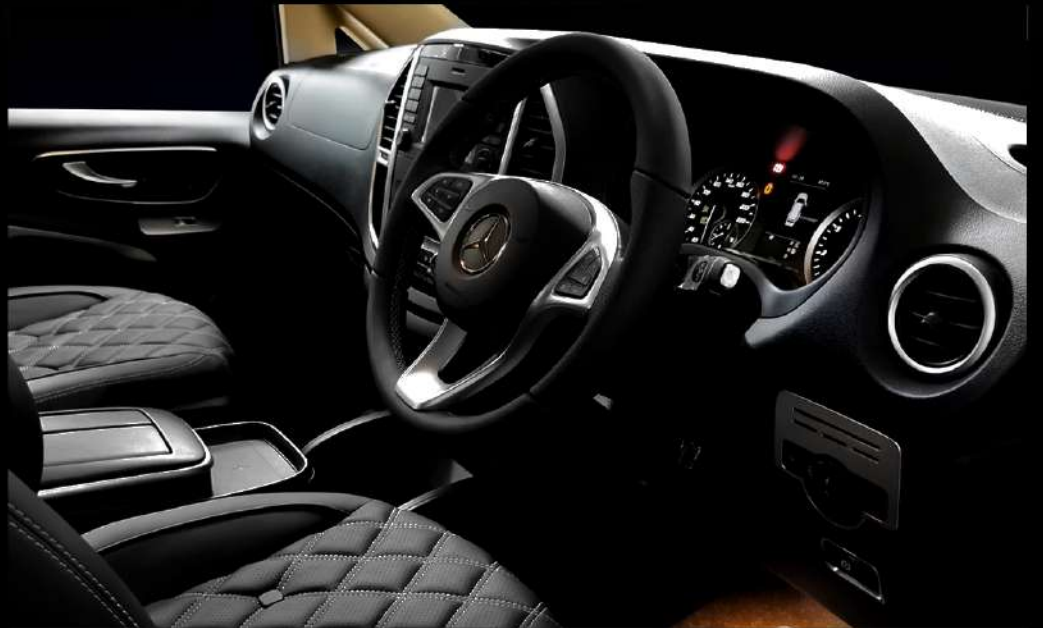
Wollsdorf nappa covered steering wheel.