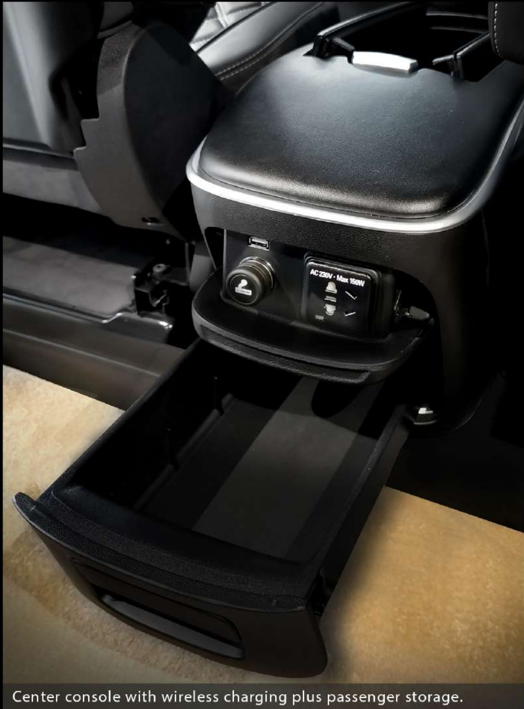
Center console with wireless charging plus passenger storage.