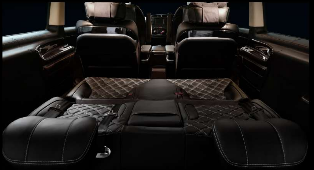
Spacious rear seat with motorized sliding and reclining system.