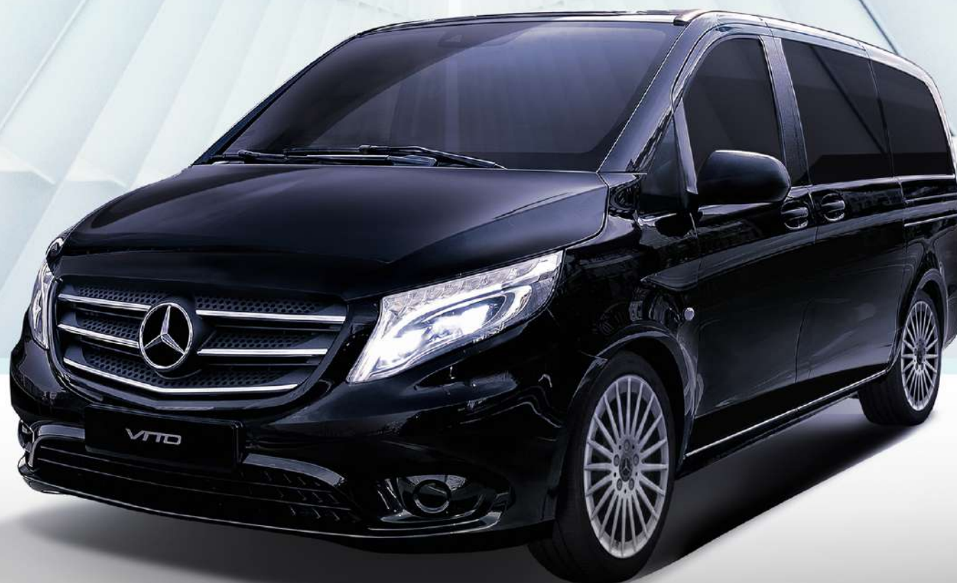
Extra large cabin with ambient light.